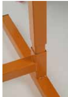
ST Series - easy slot together construction

Our ST Series frames are a heavy duty option with a slot together, 35mm box section construction and powder coated for a robust finish. Suitable for use with the Tusker curtain and strip range, with the curtain fitted over the uprights. Castors are available for extra mobility.