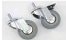
Tusker heavy duty frames can be fitted with castors for added mobility.